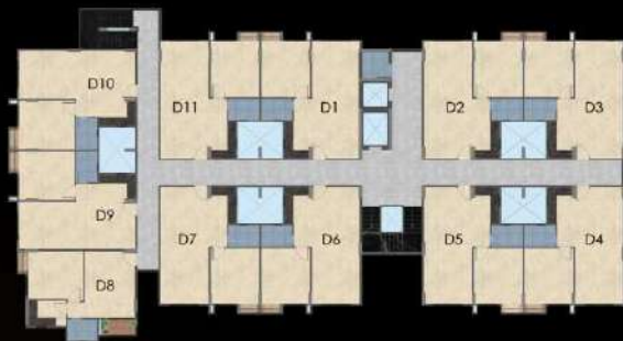
2 ND - 5 TH FLOOR TYPICAL PLAN